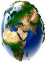
Share of Foreign Employment in Malta by Continent as at end December 2019